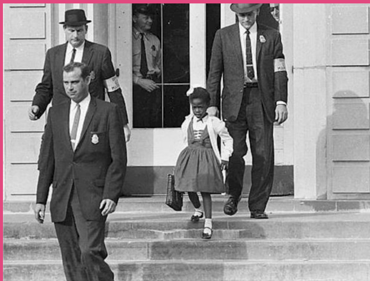
Ruby Bridges, 1960.

Polkadots: The Cool Kids Musical follows the story of Lily Polkadot, the new kid in the "Squares-Only" town of Rockaway. She is the first polkadot to attend her all-squares elementary school, where she faces bullying and segregation on a daily basis because she is different. She feels very alone at her new