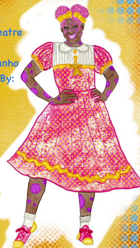
Lily Polka Dot