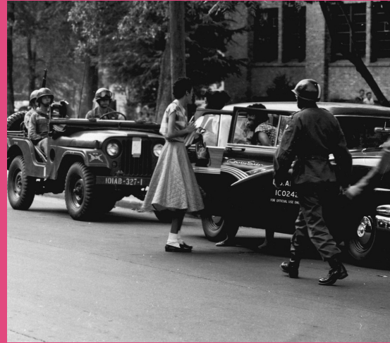
The Little Rock Nine on their way to school.